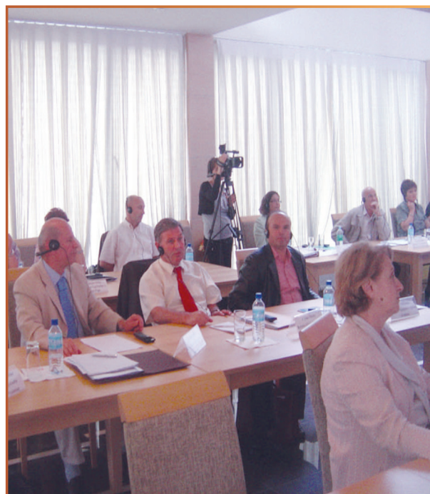
SEMINAR IN KJI